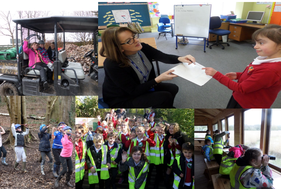
A warm welcome from all our children and staff